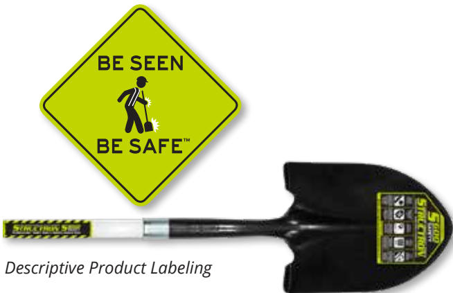
Descriptive Product Labeling

Our new Structron® Safety™ line is an excellent addition to any construction crew looking to increase worker visibility and safety during daylight and nighttime hours . Like high visibility safety clothing, Structron® Safety™ tools are safety green and utilize (2) 3M® Series 3300 tape accents made of highly retroreflective microprismatic markings, designed to enhance visibility and detection and exceed the reflectivity values of ASTM Type III.