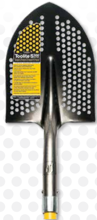
Descriptive Product Labeling & Pad Print Branding