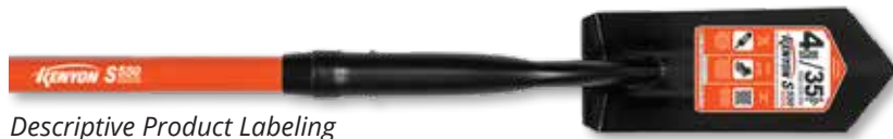
Descriptive Product Labeling & Pad Print Branding

Kenyon is the home of specialized irrigation and landscaping tools.