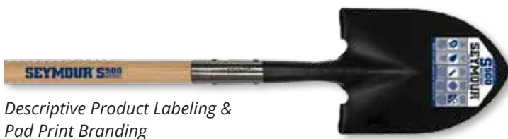
Descriptive Product Labeling & Pad Print Branding