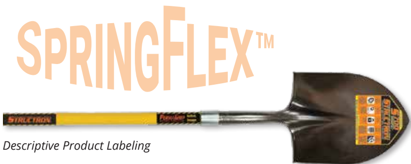
Descriptive Product Labeling

When tasked with creating the ultimate shovel our engineers specified SpringFlex™ . Manufactured to our exacting standards and exhibiting the attributes of spring steel, paired with the strength of the hallmark Structron® Solid Fiberglass Compression Rod, these eleven shovels bury everything else out there. Backed by a limited lifetime warranty, these tools are the textbook definition of "investment grade."