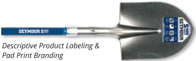
Descriptive Product Labeling & Pad Print Branding

S400 Jobsite™ is an extremely comprehensive assortment of tools. Shovels, Rakes, Scoops, Post Hole Diggers, Brooms, Pruning Tools...S400 Jobsite™ is up to any task!