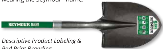
Descriptive Product Labeling & Pad Print Branding

S300 DuraLite™ offers exceptional value, absolute continuity with the rest of the Seymour Midwest brand levels from a planogram perspective and as always worthy of wearing the Seymour® name!