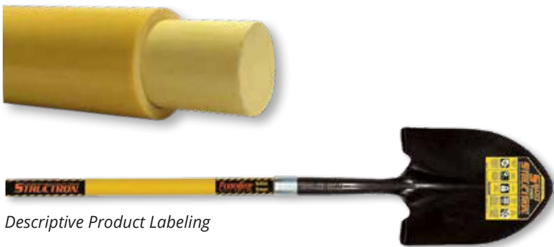
Descriptive Product Labeling

PermaGrip™ - A rivetless ring of steel connects the shovel neck, handle and fiberglass insert, making it one solid unit. Provides the strongest head to handle connection.