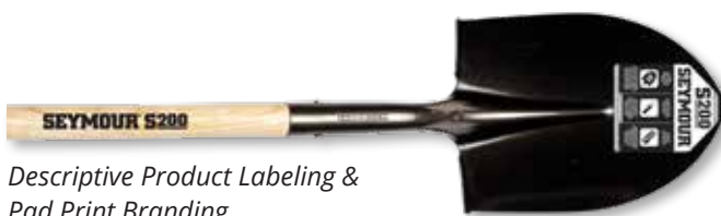
Descriptive Product Labeling & Pad Print Branding

Our ‘good’ offering is truly special. Contoured handles with a clear lacquer finish are features that are second to none. And towards our goal of providing a coherent merchandising platform regardless of the series displayed in your store, we’ve invested in blade labels that follow the updated Seymour Midwest format and a series pad print on the handle. We wouldn’t put our name on it if it wasn’t good enough to be a Seymour tool.