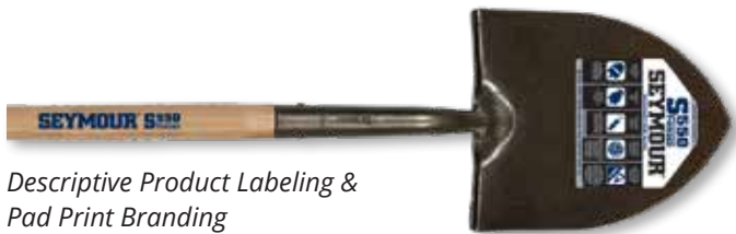
Descriptive Product Labeling & Pad Print Branding