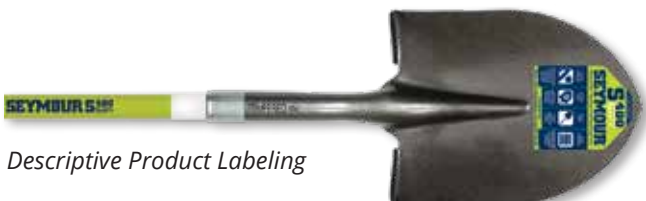
Descriptive Product Labeling