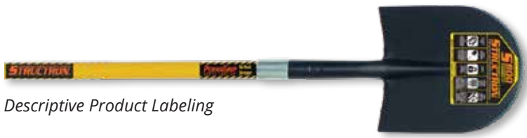
Descriptive Product Labeling

Also up to the task and featuring premium Structron® fiberglass and our PowerCore™ for unrivaled strength the rest of the S800 SuperDuty™ line-up all feature the original forged blades and proudly sport the updated Structron® product identity.